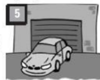
5 car / garage