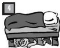
4 boy / bed