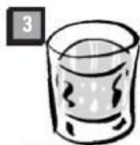
3 juice / glass