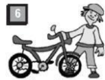
6 Nat / bike