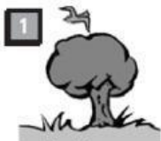
1 bird / tree

E Write sentences about the pictures. Use the words below and a preposition.