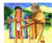
He put on a robe.

6. Esau plan to kill Jacob after his birthright blessings was stolen by Jacob?