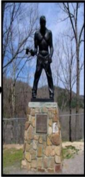
A statue of John Henry.