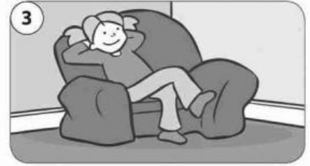
My new chair is very comfortable .