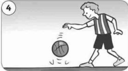
In basketball, you have to bounce the ball.