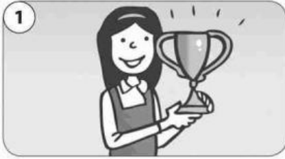
I won a trophy last week.