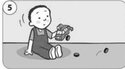
His toy broke , but it was very cheap .