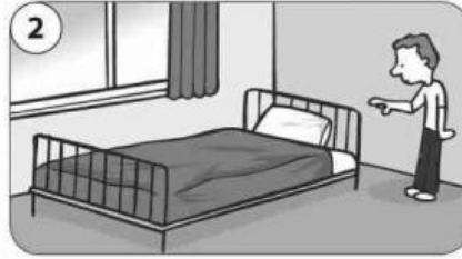
This bed is hard .