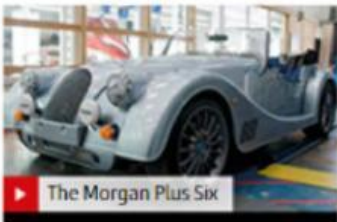
The Morgan Plus Six

★ 10 Watch the video again and complete the text.