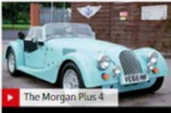
The Morgan Plus 4