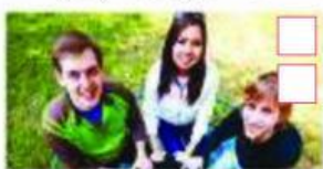
hang out with friends