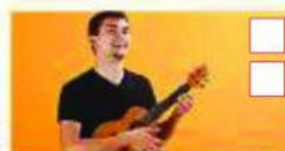
play a musical instrument