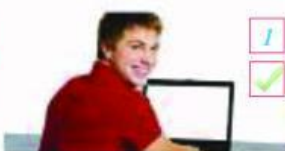
chat with friends