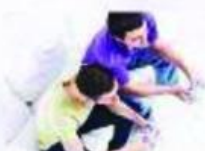
play video games

Pay attention to background sounds to understand the context of the speakers.