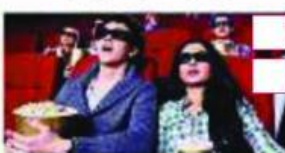
go to the movies