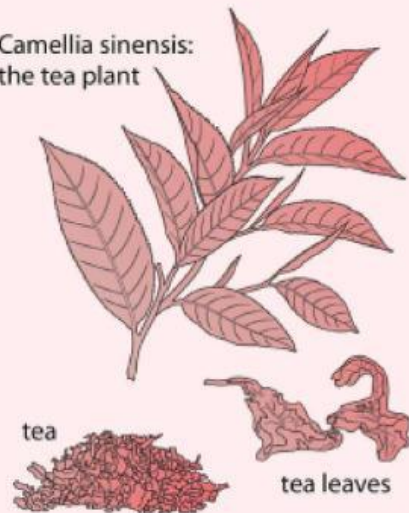
Camellia sinensis : the tea plant

All tea is made from the leaves of the tea plant, Camellia sinensis , but our tea is very special. A hundred percent of our tea 1 _____ directly from small organic tea farms in Darjeeling, in northern India. Once a year, our team 2 _____ the farms and meets the farmers and tea-leaf pickers. We work hard to protect small farms and the environment. Each farmer 3 _____ a fair price and we always check that the workers on the farm are happy. A lot of the tea-leaf pickers are women and we 4 _____ that they 5 _____ a fair wage and are helped with childcare costs. The tea leaves 6 _____ four or five times a year. They 7 _____ and processed and then they 8 _____ to our factories, where we package the tea. All our packaging 9 _____ by our creative team and made from recycled materials. Finally, our tea 10 _____ to shops and supermarkets all over the country.