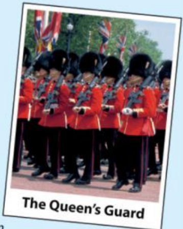
The Queen's Guard

One of the most prestigious jobs in the UK is guarding the Queen of England. The Queen's Guard, in particular the Foot Guards that stand outside Buckingham Palace in London, are an iconic English symbol. The Guard consists of three officers and 36 soldiers from five regiments (Grenadier Guards, Scots Guards, Coldstream Guards, Irish Guards, Welsh Guards). When the Queen is home, there are four Foot Guards at the front of the building and only two when she is away. They have the most recognisable uniform in the world. They wear a scarlet tunic, white belt, dark blue trousers with a red stripe down each leg and a huge bearskin hat. The bearskin hats are made of real bearskin from Canadian brown bears. For a long time, the British Army has tried to find a manmade alternative to the fur, but so far nothing acceptable has been found.