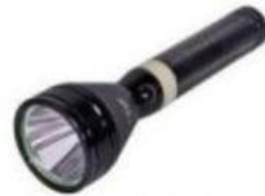
Torch / Flashlight