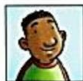
his best friend