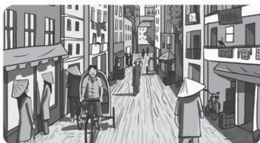
3 Transport in your town fifty years ago