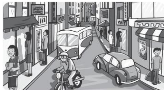
5 The town in this picture