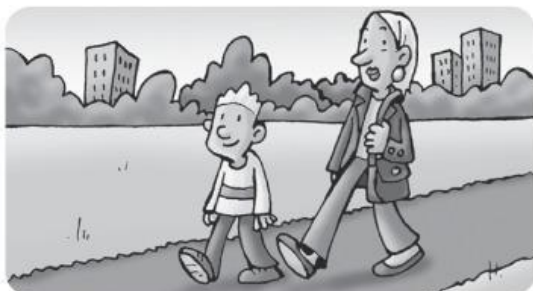
2 How you go to school