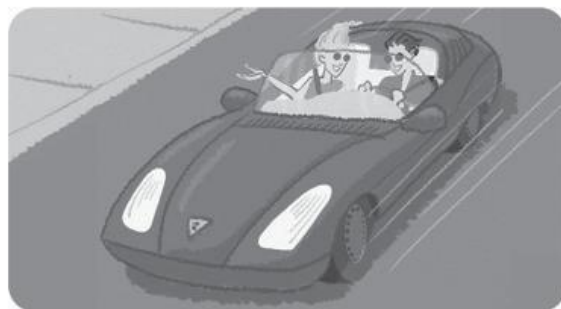
4 Your favorite way to travel