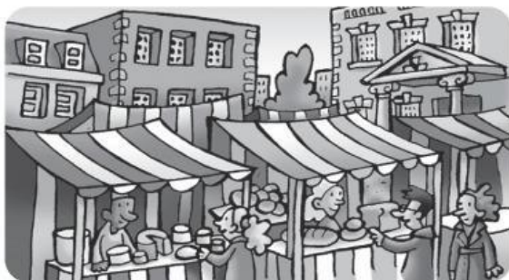
1 Places in your town fifty years ago

Student B: Listen to your partner talk about the picture card for one minute. Then ask them three questions about it.