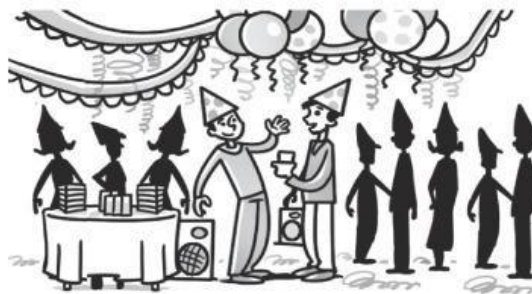
6 Your last birthday party