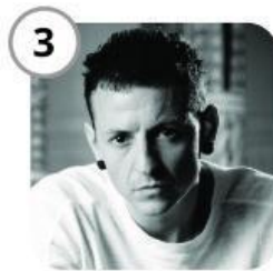
D Chester Bennington