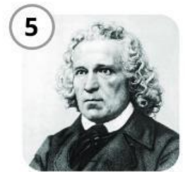
F Jacob Grimm