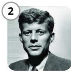
B John F. Kennedy