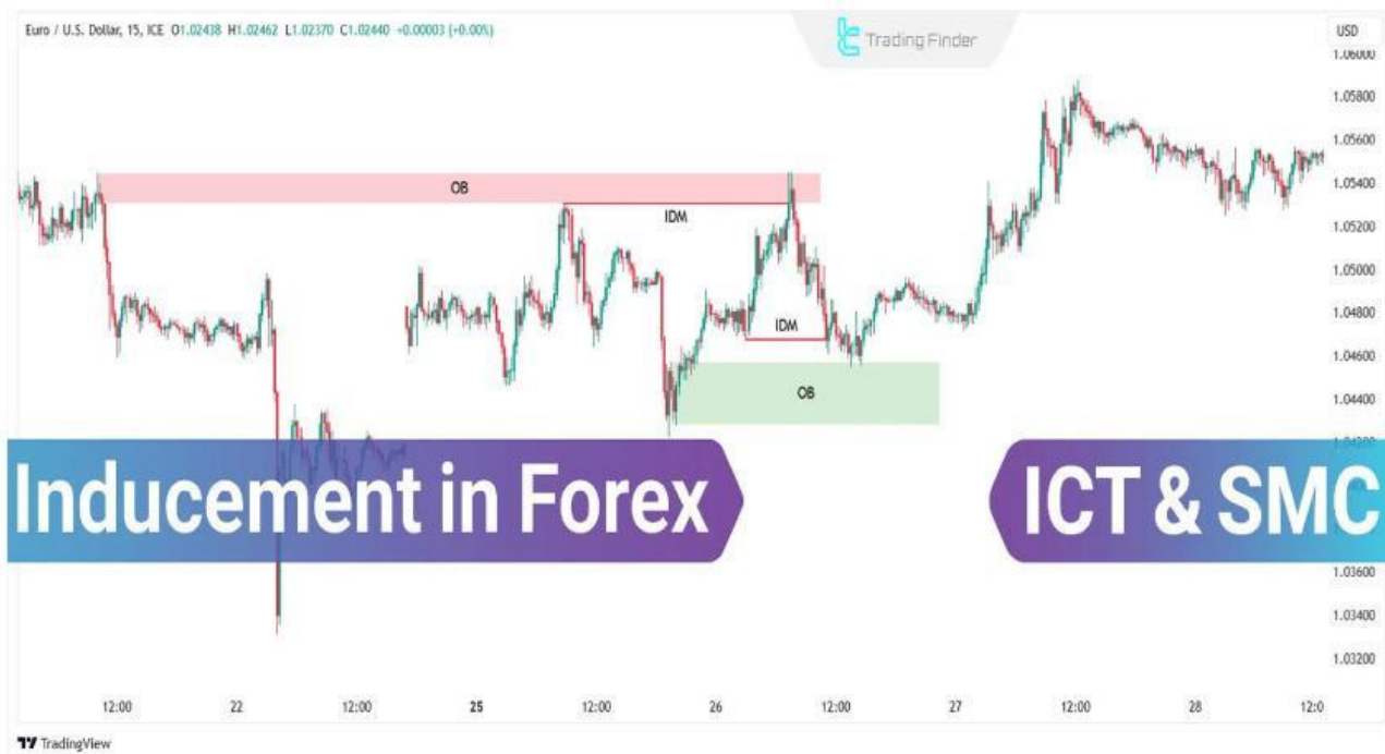
Inducement in ICT & Smart Money Trading Strategies

Inducement in Forex and financial markets refers to a form of market manipulation by large players (including institutional investors or "smart money" ).