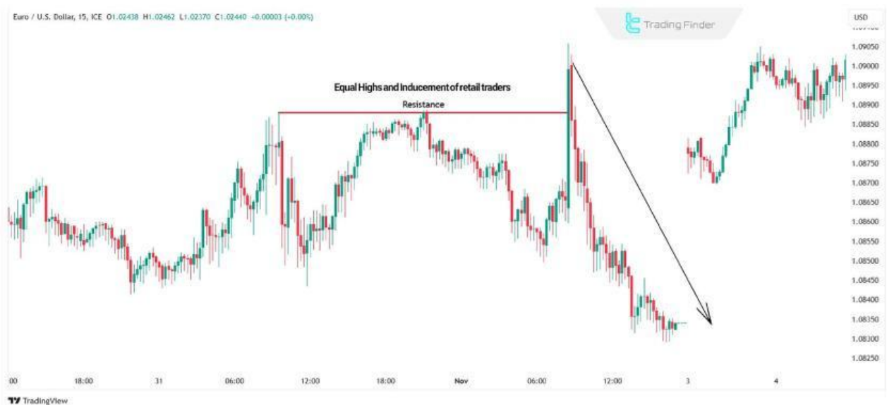
Formation of Equal Highs (Resistance) Acting as Inducement Levels

However, instead of reversing , these levels become liquidity traps , leading to stop-loss hunts followed by a price reversal in the opposite direction . This is known as False Breakouts .