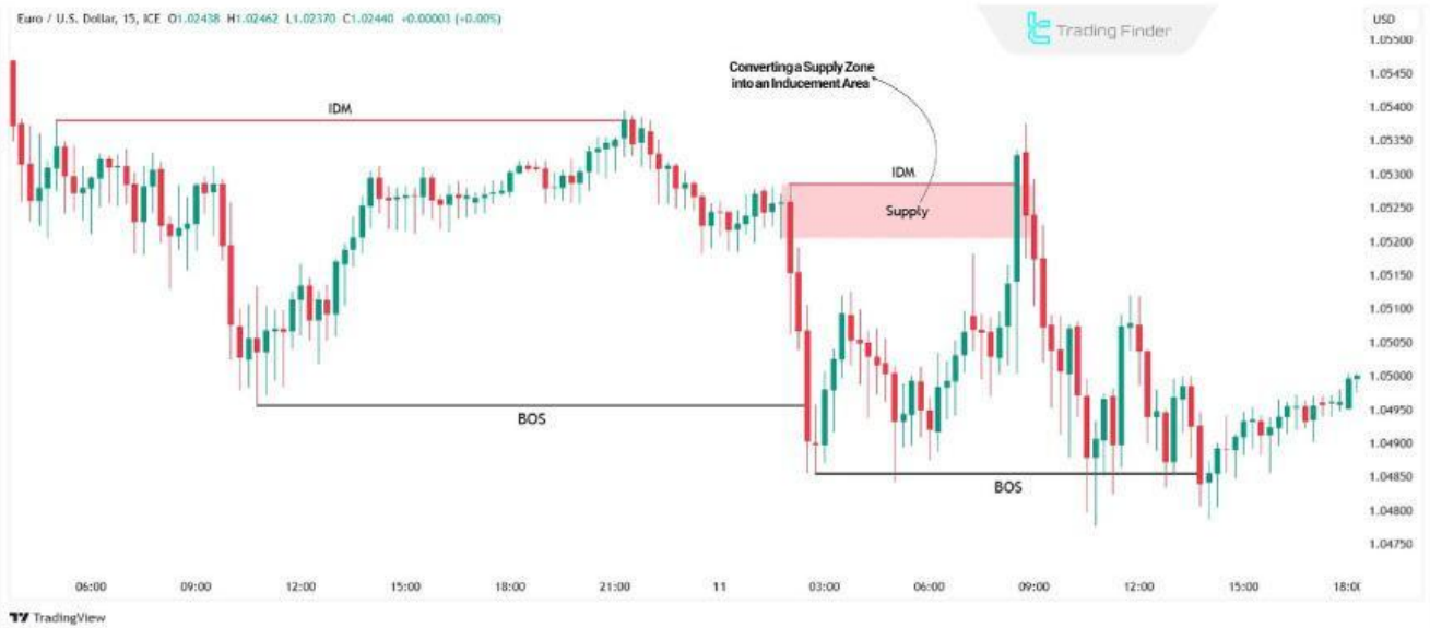
Supply Zone Acting as an Inducement Level in SMC Trading