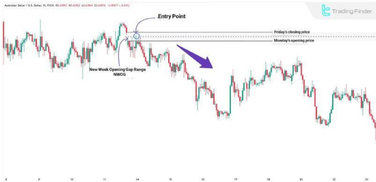
Bearish Trading with NWOG (New Week Opening Gap)

The AUD/USD chart on the 1-hour timeframe illustrates the behavior of NWOG in a downtrend.