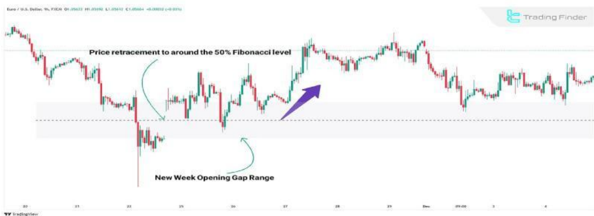
Bullish Trading with NWOG (New Week Opening Gap)

The EUR/USD chart on the 1-hour timeframe illustrates the behavior of NWOG in an uptrend.