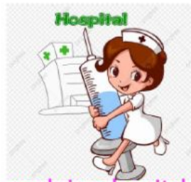
work in a hospital