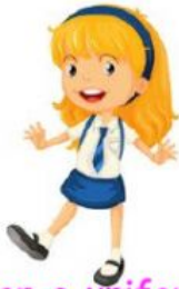
wear a uniform