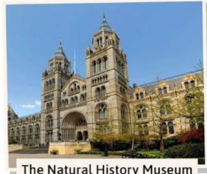
The Natural History Museum

a About 100 years ago, (1) Covent Garden was a busy fruit and vegetable market. Over the years, it has changed a lot and now it is a very popular tourist destination. There are many small independent shops and you can find lots of interesting things to buy.