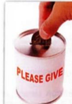
7 I'd like to give money to charity .