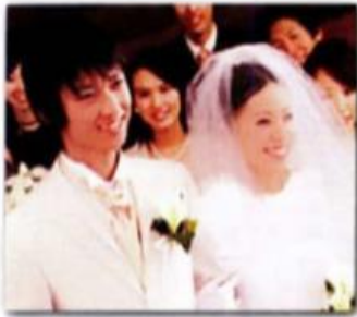
1 I'd like to get married .