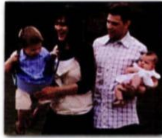
2 I'd like to have children .