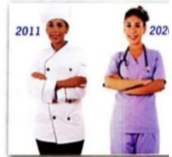
4 I'd like to change career