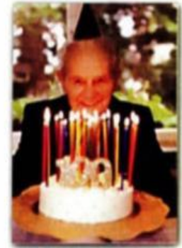
8 I'd like to live a long life .