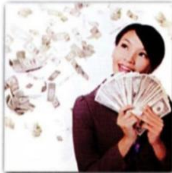
6 I'd like to make a lot of money .