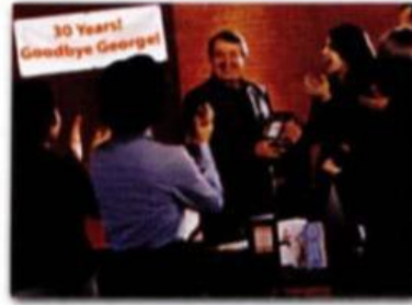
3 I'd like to retire .