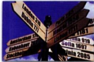
5 I'd like to travel .