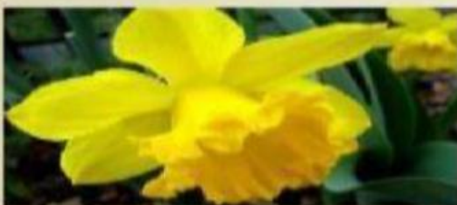
The national symbol of Wales