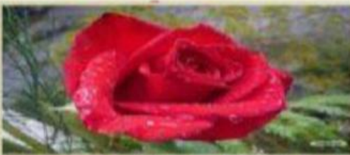
The national symbol of England