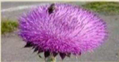
The national symbol of Scotland