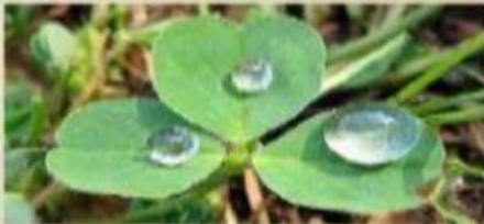
The national symbol of Northern Ireland