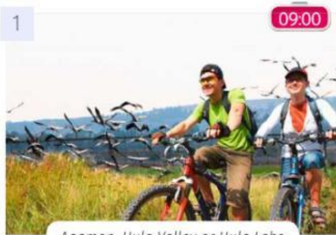
Agamon, Hula Valley or Hula Lake

Look at these different places in Israel and say what was happening in each place at the time mentioned. Use the words below each picture and the Past Progressive. You can use the words to write one or two sentences.