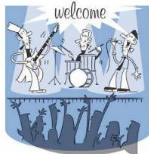
1 the concert / start _____