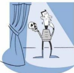
3 the actor / forget what to say _____