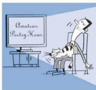
2 Dad / fall asleep _____