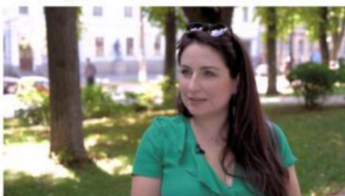
5. Kate ____