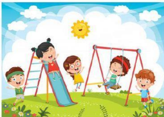
5- Playing safely