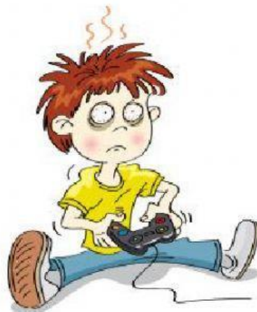
4- Playing video games at a near distance