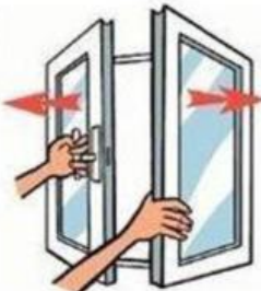
open the window