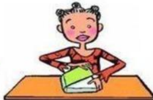
close your book