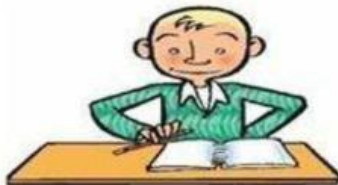
take your pencil