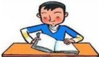
open your book