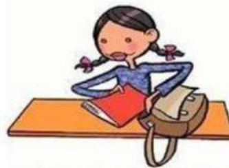
take your exercise book