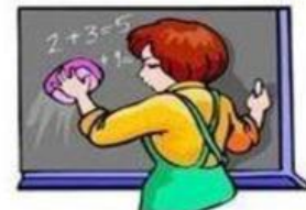
erase the board