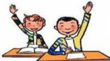
raise your hands