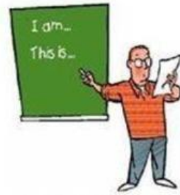
Look at the board