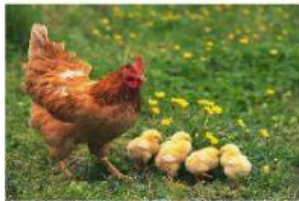
Hen and chickens

5. Match each picture with its relationship: