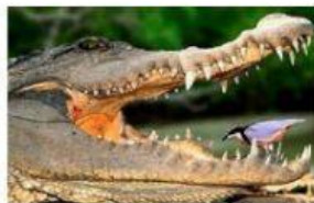
Plover and crocodile