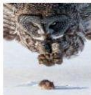
Owl and mouse