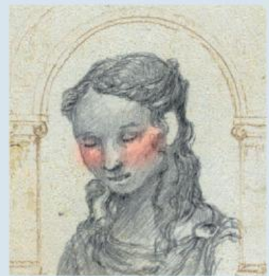
c _ _ u _ _