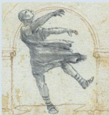
a s l i p

1 Complete the labels with new words from Chapter 5.