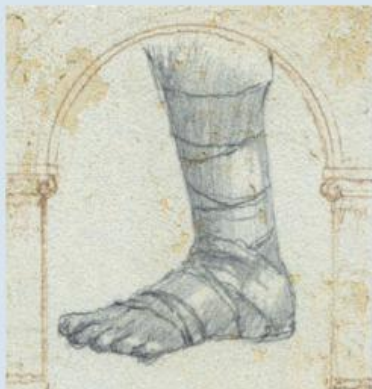
d _ a _ _ a _ e