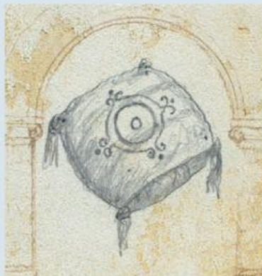
e _ u _ _ i o _