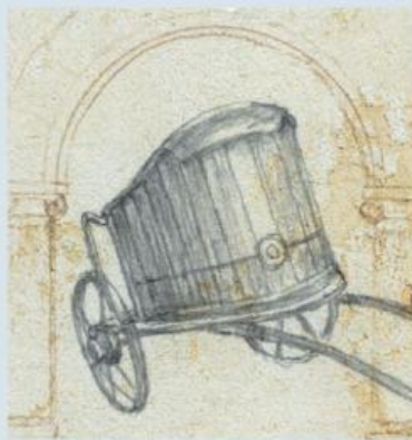
b _ _ a _ i o _