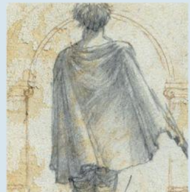
f _ _ o a _