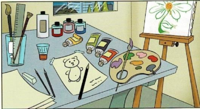
The New Art Class