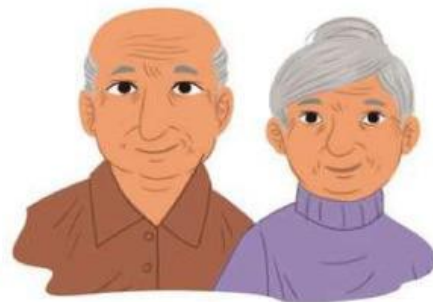
Alexander and Leila

Meena has a brother, Sanjay. Sanjay is Kavita and Ravi's 1 uncle and Sanjay's wife is their 2 ..... . Sanjay and his wife have one son, Prem. Prem is an 3 ..... . Henry's parents are still alive. Alexander is Henry's 4 ..... and his 5 ..... Leila is Henry's 6 ..... . Alexander and Leila have three 7 ..... -Amelia, Ivan and George. Ivan and George and their 8 ..... , Anne and Meena, love their 9 ..... and visit them as often as possible.