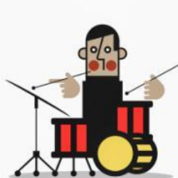
1 a drummer

the audience the cast a drummer a lead guitarist a musician a singer-songwriter a viewer a vocalist