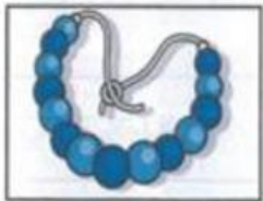
2 the necklace