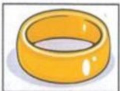
4 the ring