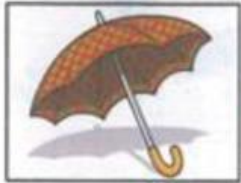
1 the umbrella