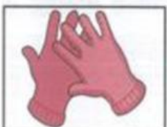
5 the gloves