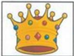
3 the crown