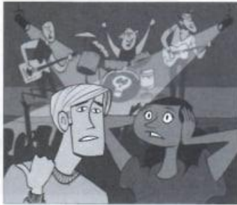
1 Let's go home.

Let's go home. Let's go there. Let's not eat here. Let's open the window. Let's sit here. Let's stop here.