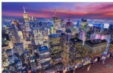
Top of the Rocks