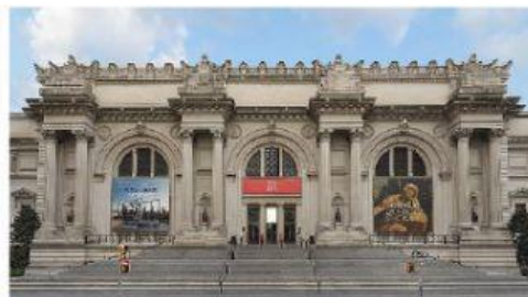
The Metropolitan Museum of Art (the MET)