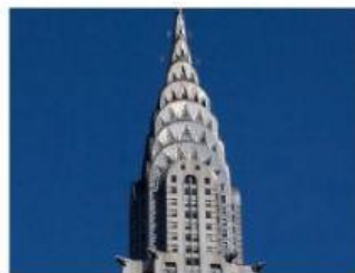
The Chrysler Building