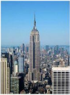
The Empire State Building