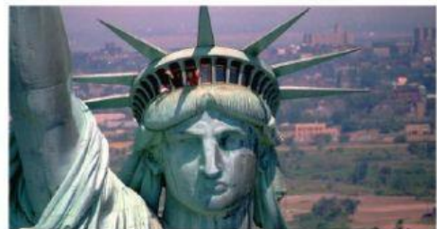
The Statue of Liberty