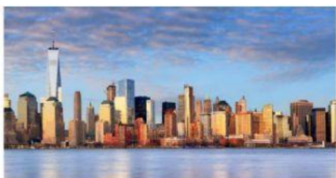
View from the sea