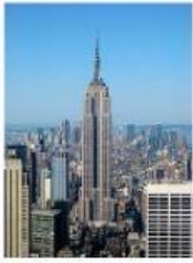
The Empire State Building