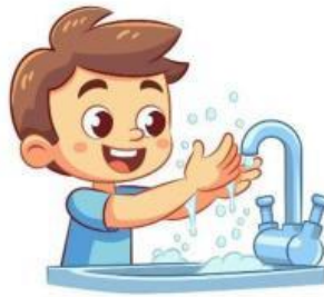
WASHING MY HANDS