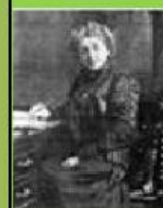
Josephine Cochrane 1839-1914 Place: Ohio, USA Profession: Inventor Invention: the dishwasher

She was an _____. She _____ the dishwasher.