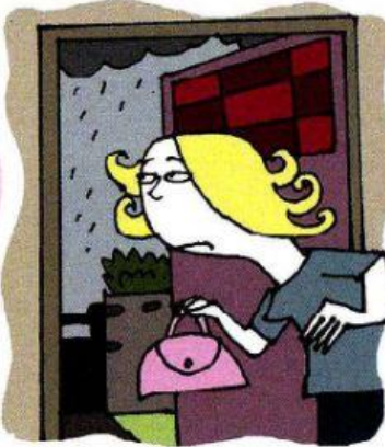
5 It / rain .....