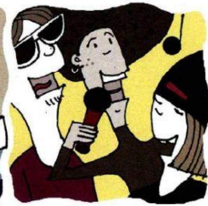
6 We / sing .....

2 Complete this postcard with the present continuous form of the verbs in brackets.