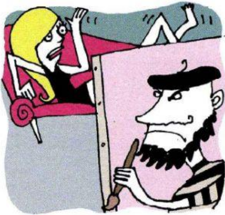
4 You / move .....