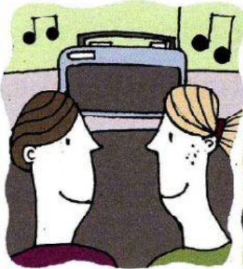
2 They / listen .....