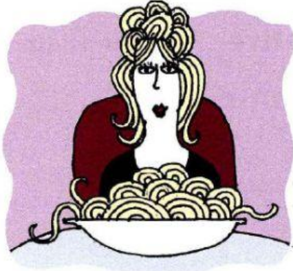
1 I / eat ..... I'm eating .....

1 Look at the pictures and write sentences.