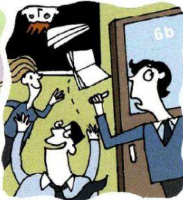
3 The teacher / come .....