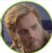
Obi Wan Kenobi