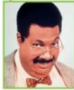
The Nutty Professor

? Have got – questions and short answers