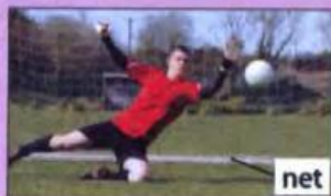
Goalkeepers try to stop the ball going into the net.