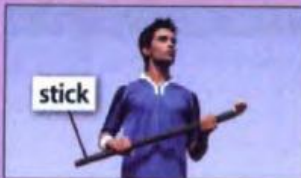
Hockey players hit the ball with a stick.