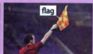
Linesmen wave a flag.