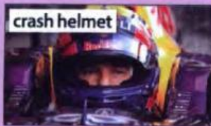
Motor racing drivers wear a crash helmet.