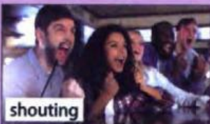
Supporters (also called fans) use their voices and shout a lot.