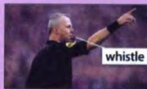
Referees blow a whistle.