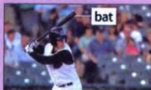
Baseball players hit the ball with a bat.