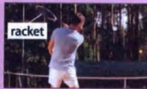
Tennis players hit the ball with a racket.