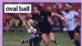
Rugby players play with an oval ball.