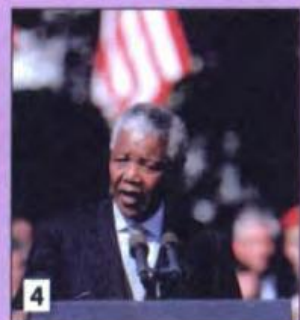
4 Nelson Mandela