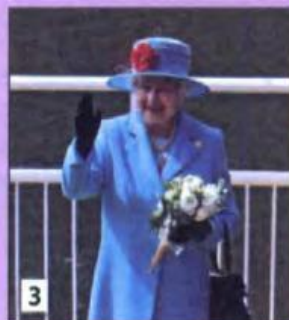
3 Queen Elizabeth II