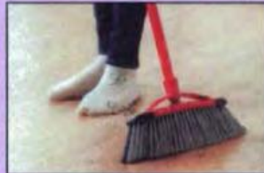
sweep pt/pp swept