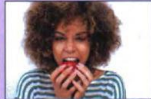
bite pt bit pp bitten