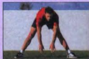
bend pt/pp bent