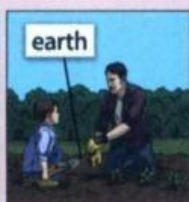
earth plant v plant n