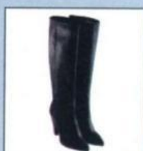
a pair of boots