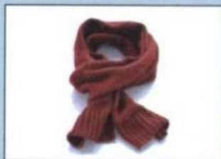
scarf (pl scarves)