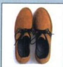
a pair of shoes