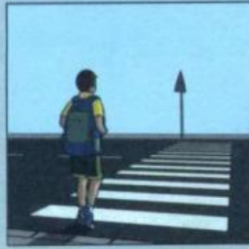
go across the road