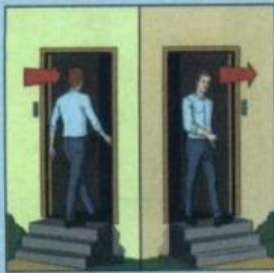
go into go out of (the house)