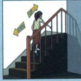
go up go down (the stairs)