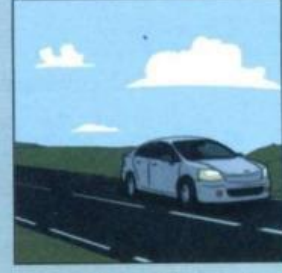
go along the road