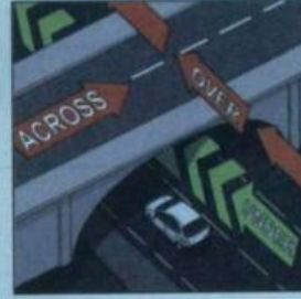
go under go across/over (the bridge)