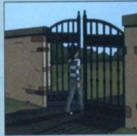
go through the gate