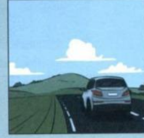
go towards the hill