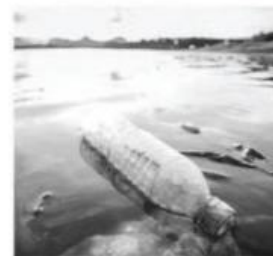
▲ Shells are biodegradable. Plastic bottles are not.