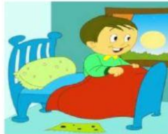
Early to bed, early to rise.