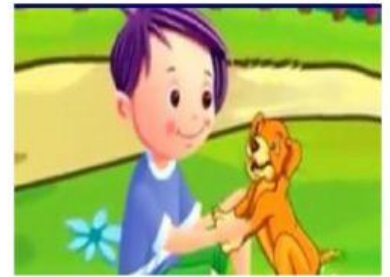
Love your pets .