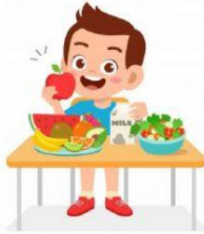
Eating healthy food .