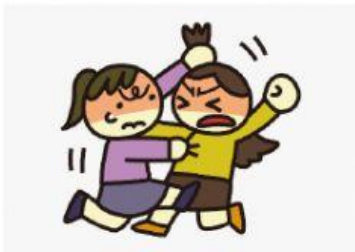
Fighting with others.