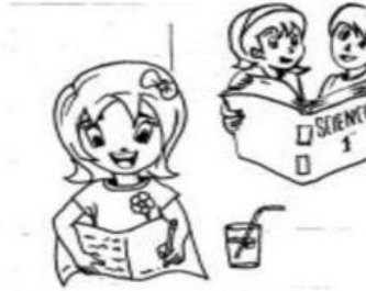
Grade 1 pupils are studying their lesson.