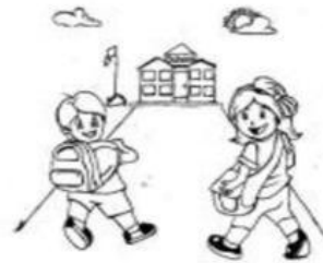
Grade 1 pupils going to school.