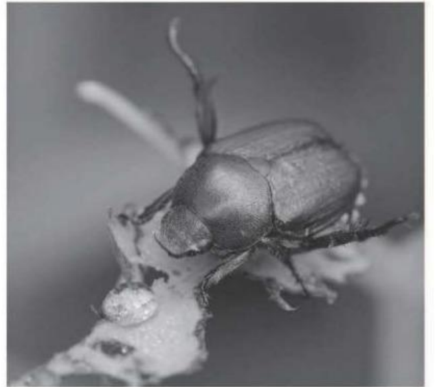
▲ an insect