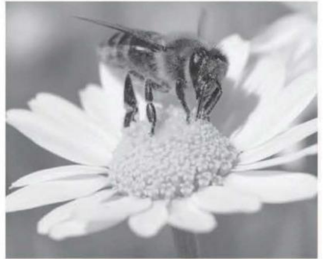
▲ a bee