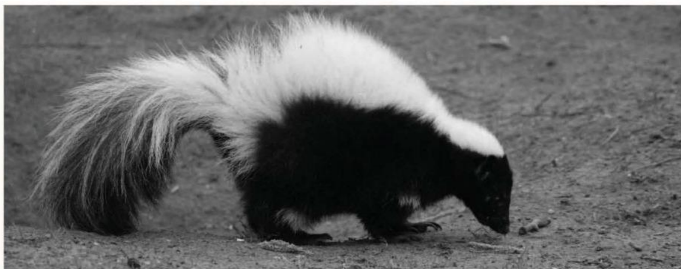
▲ a skunk