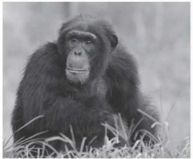
▲ a chimpanzee

And, of course, many animals communicate with sounds. Birds use their beautiful songs to communicate. Dogs, cats, and people all make different kinds of sounds to send many different messages.