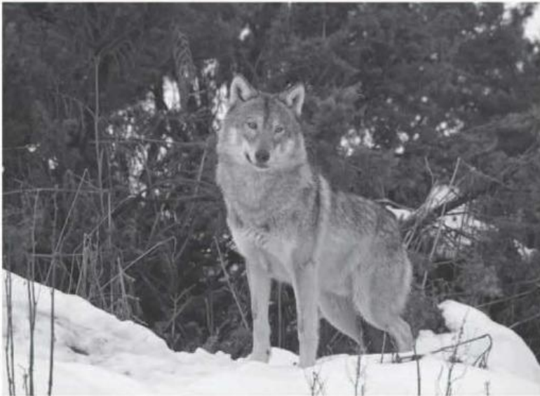
▲ a wolf