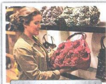
buying things I don't need