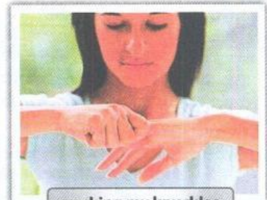
cracking my knuckles

"One thing you could do is cut up your credit cards. And why don't you...?"