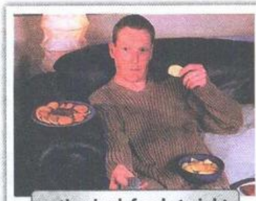
eating junk food at night