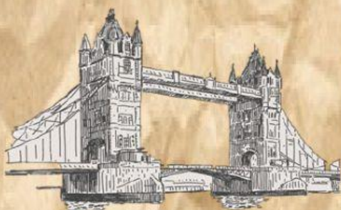
Tower Bridge in London.

Before 1590 he left Stratford and went to London, the capital city of England. There, he worked as an actor in an acting company. These companies were formed by around ten actors, where young boys played women's roles because women couldn't act in plays. He also began to write plays. In 1593 the plague killed thousand of people and theatres were closed, so he started to write sonnets (a kind of short poems).