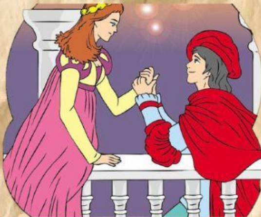
Romeo and Juliet at a balcony.

Many years ago in Verona, Italy, there were two families: the Capulets and the Montagues. These families were always fighting. The Montagues have a son, Romeo. The Capulets have a daughter, Juliet. Romeo met Juliet and they fell in love. They decided to get married, but they knew that their families would be very angry. After some fights, the Prince of Verona exiled Romeo out of the city. Juliet drank a substance-similar to a poison, to pretend to be dead, so she could meet Romeo later. Romeo didn't get the message about the plot, drank a real poison and he died. When Juliet woke up, and knew about the death of her lover, she committed suicide too.