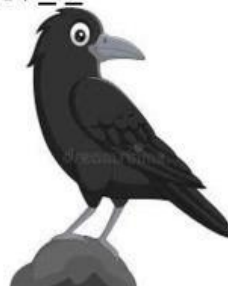
9. _ _ _ W