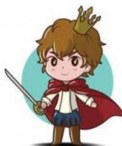
5. _ _ _ N _ _