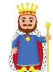
2. _ _ _ G