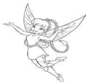
4. F _ _ _ Y