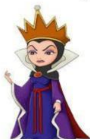
8. Q _ _ _ _