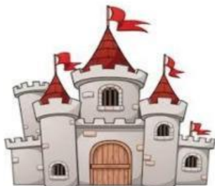
1. C _ _ _ E