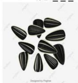
7. _ _ _ D