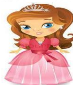
6. p _ _ _ C _ _ _