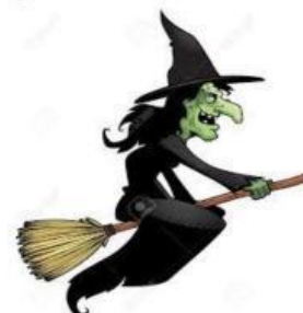
10. w _ _ _ _