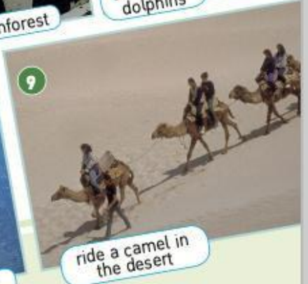
ride a camel in the desert