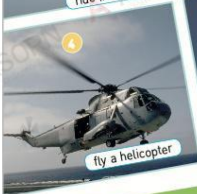
fly a helicopter