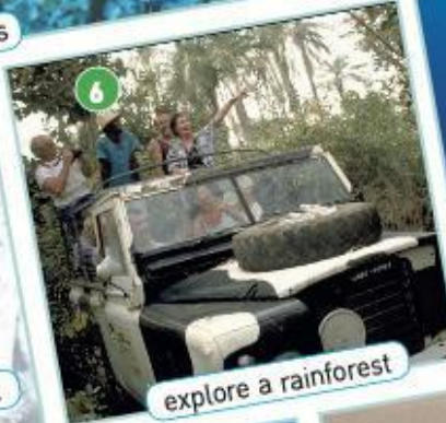
explore a rainforest