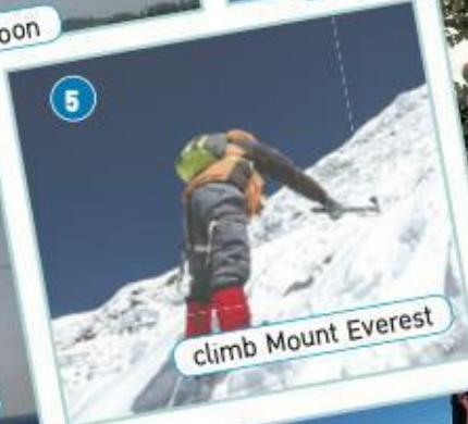
climb Mount Everest