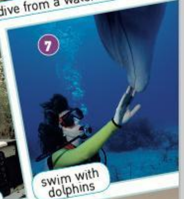
swim with dolphins