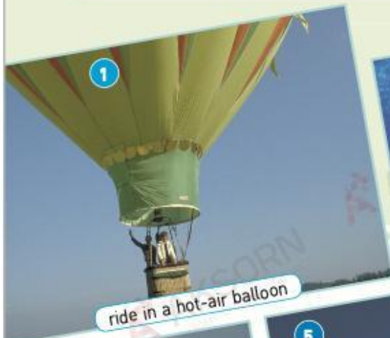
ride in a hot-air balloon

I'd like to swim with dolphins. I think it's exciting. I wouldn't like to ride in a hot-air balloon. I think it's dangerous.