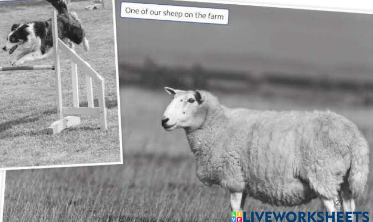
One of our sheep on the farm